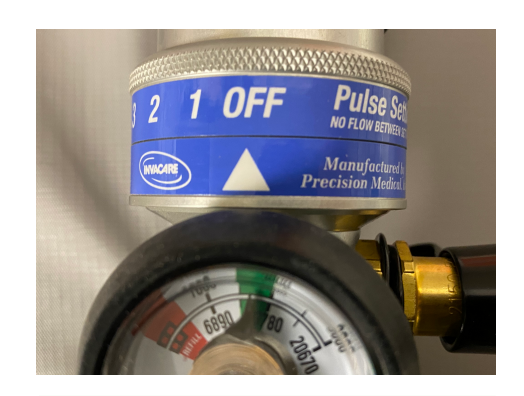
Turn OFF the tank before filling or when not in use