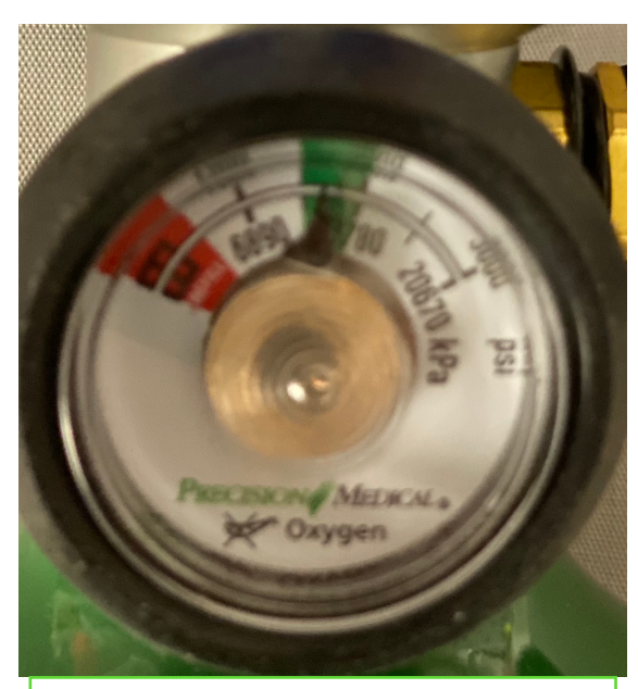
FULL TANK AT 2000 PSI