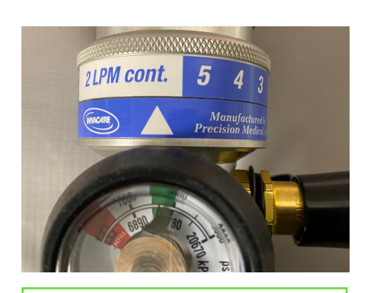
CONTINUOUS FLOW in WHITE ZONE 2 LPM Oxygen flows continuously