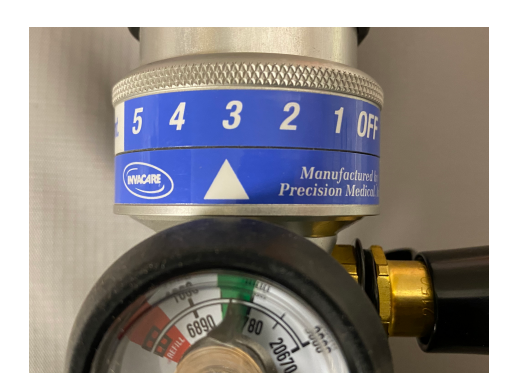
PULSE FLOW 1 - 5 in BLUE ZONE Oxygen flows ONLY when you breathe in

Turn OFF the tank <u>before</u> filling, or when not in use, by rotating the valve handle CLOCKWISE until it stops.