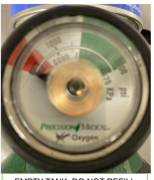
EMPTY TANK. DO NOT REFILL UNTIL BELOW 1000 PSI